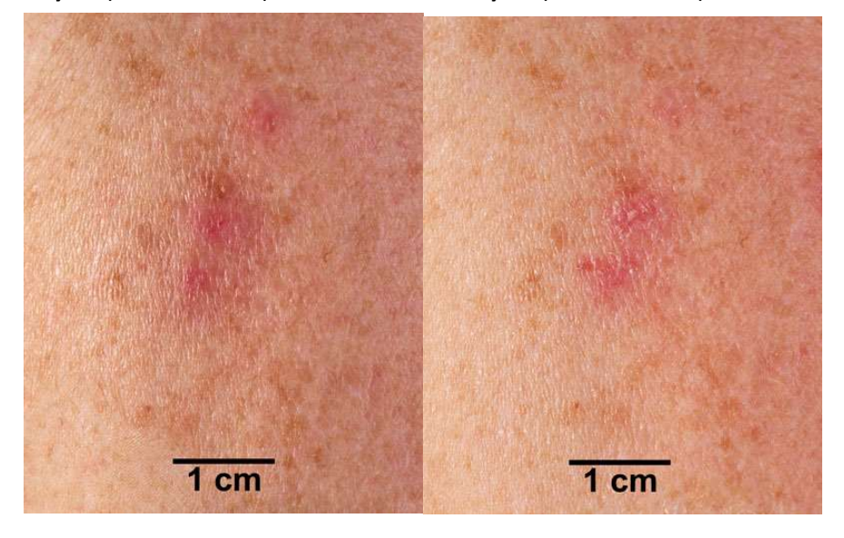
Day 14 (Revaccination)