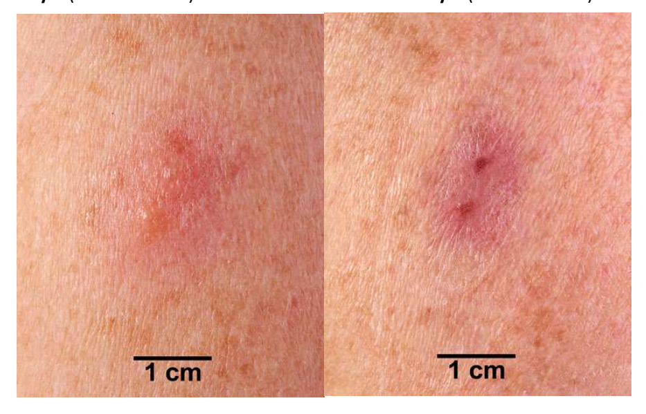
Day 10 (Revaccination)